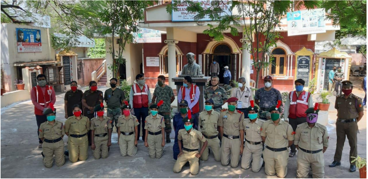
A group photo with all the cadets and officer who donated the blood on the occasion of Dr B R Ambedkar's Birth Anniversary, 14 th April 2020.