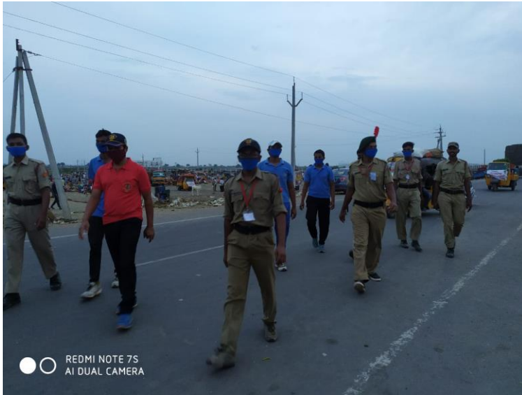
ANO accompanying the cadets in the market